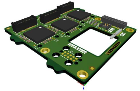
Layout for the PortCard of the CMS Pixel (TEPX) detector (groups Botta, Caminada, Canelli, Kilminster).