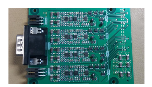
First prototype boards for the 20 bit, 1.5MS/s ADC for DAMIC-M.

preamplifier for fast oscilloscopes, a programmable fast pulse generator with <100ps rise-/fall time, and a SALT128TB testboard for the UT detector of LHCb the design of low-temperature high frequency printed circuit boards, silicon photomultiplier testboards as well as documentation and testing of the FlashCam for CTA.