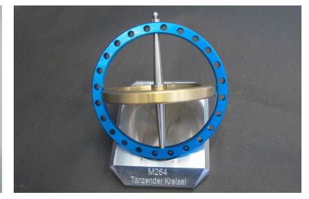
The three photograph are examples for work done in our workshop for external institutes (left: anatomy institute), research groups (middle, group Chang) and education (right).